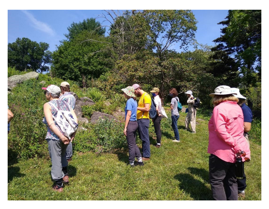
Henry Foundation Field Trip