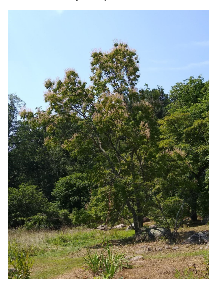
Elliotia racemosa (Georgia plume)

On Saturday July 24th members of the Delaware Valley Fern and Wildflower Society (DVFWS) met under clear skies and moderate temperatures at the Henry Foundation for Botanical Research in Gladwyne to experience their Wilderness Garden grounds https:// www.henrybotanicgarden.org/. Twenty people met, including 13 DVFWS members along with members of the Philadelphia Botanical Club and the Delaware Valley Chapter of the American Rock Garden Society. This was the first time that a joint field trip was held with these three groups, and the general consensus was that it was a great chance to meet members of the different groups. Plans are underway to schedule similar joint trips.