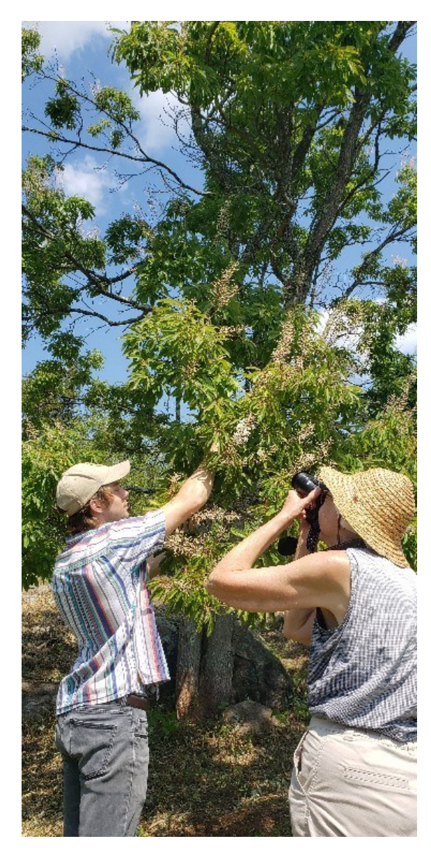
(Continued on page 6)

Cyrilla racemiflora (swamp titi): a southeastern shrub deserves to be better known, as it has abundant white flowers and vivid fall color. I normally think of this as a medium-sized shrub, but the Henry's specimen approaches the size of a single-car garage.